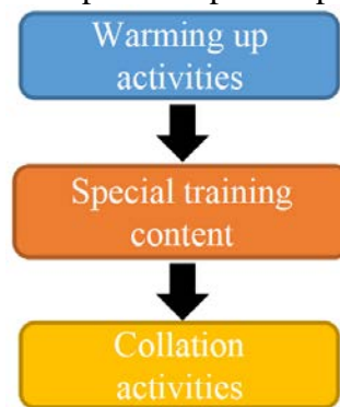
Figure 1 The system structure of Taijiquan special subject injury prevention method

By reasonably organizing the content of preparation activities and reasonably connecting general warm-up exercises with special warm-up exercises, you will be able to carry out preparation activities similar to the special skill requirements of Taijiquan and prevent sports injuries in the special training of Taijiquan. The structure of Taijiquan to prevent special sports injuries is shown in Figure 1.